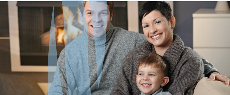
Enjoy the convenience and safety of an IntelliDraft solution

Maintaining a proper and safe draft condition for the fireplace and the room providing it air for combustion are big challenges in today's tight construction. IntelliDraft is designed specifically to meet these needs.