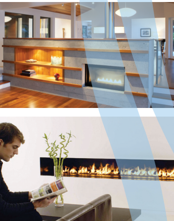
Any fireplace design works with IntelliDraft