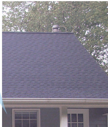
A discreet termination