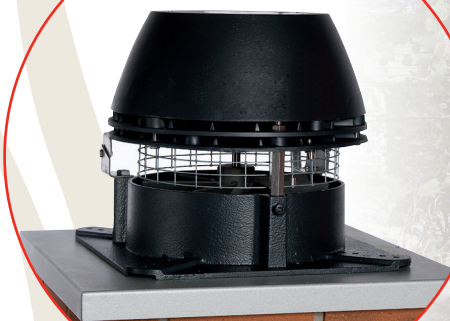
RS Chimney Fan

The perfect fire features a flame that's just the right size – not too high or too low and that doesn't allow smoke to escape from the fireplace.